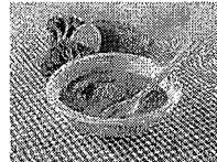
Stage 2 baby food

As one might imagine, FEMA must procure a wide range of products and services as it attempts to implement a sweeping disaster relief operation in the wake of Hurricane Sandy.